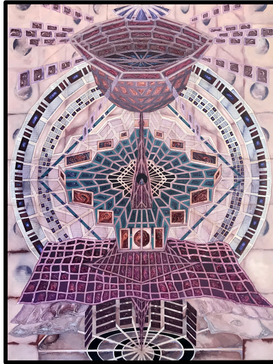
Trans-spatiotemporal Manifestation of Being

(2020, 50x35, oil, graphite, ink, wax pastel on canvas)