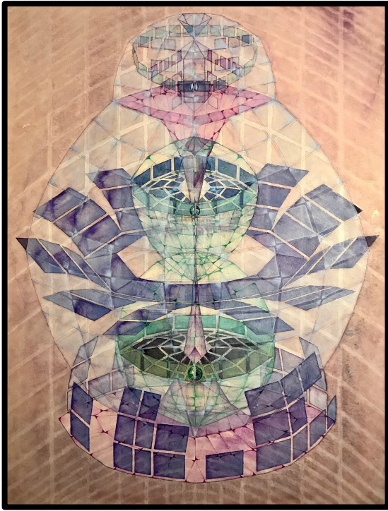
Leaping Through Moments of Becoming

(2020, 50x35, oil, graphite, ink, wax pastel on canvas)